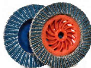
PLUS disc(sn) and VORTEX HT (dx).