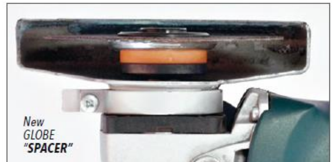
No shaft protrusion thanks to the special higher spacer.