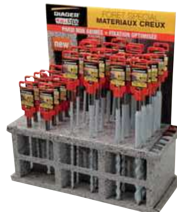
PLV picking-counter 30 drills to choose Delivery unmounted Ref.C00084