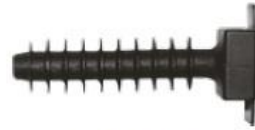
5456 AE - 5458 AE