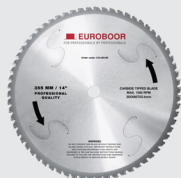
Sawblade 66 teeth 130.355/66