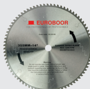
Sawblade 80 teeth 130.355/80